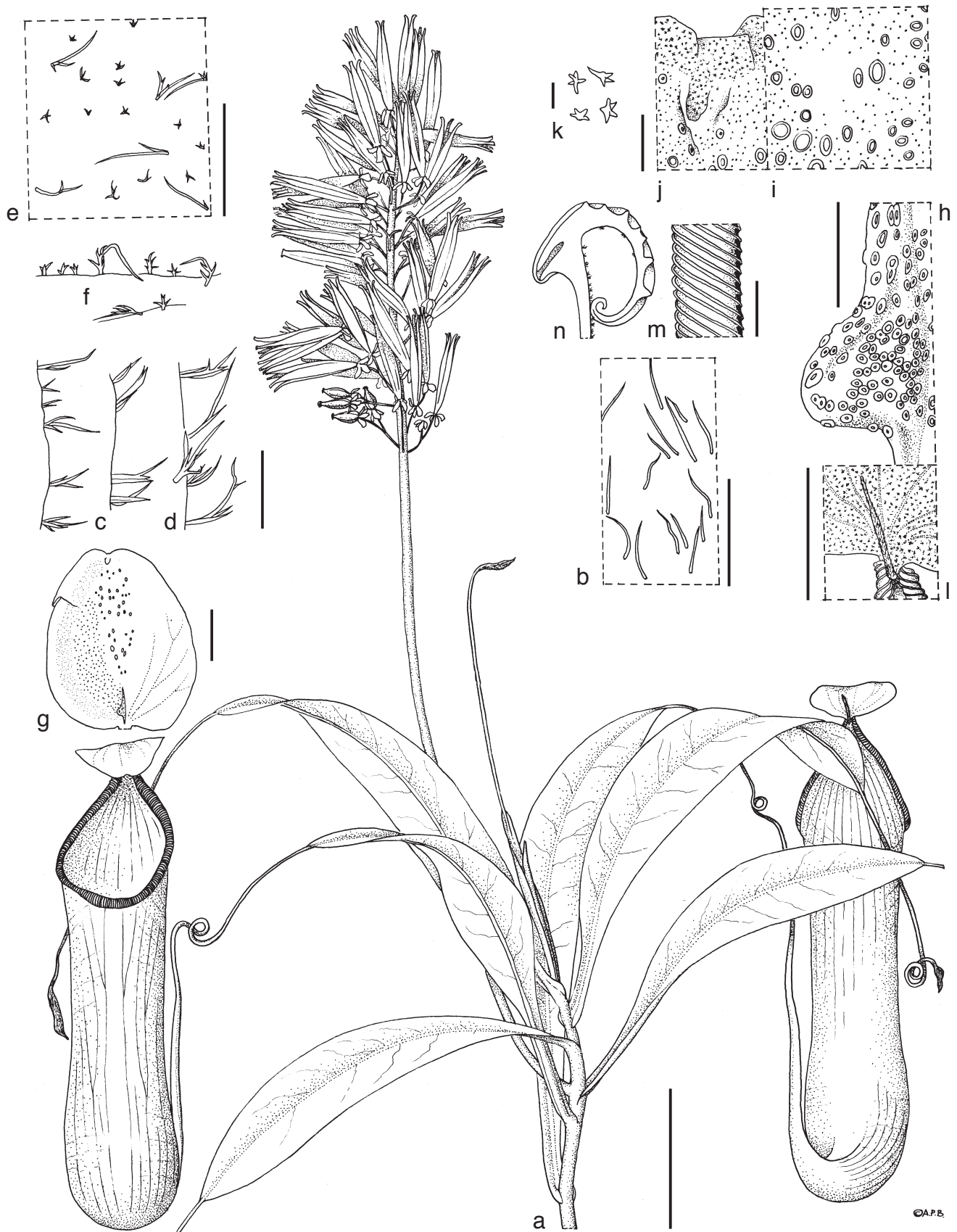
Fig. 2 Nepenthes tболи Jebb & Cheek. a. Habit, with upper pitchers and infructescence; b. leaf-blade midrib, lower surface, indumentum; c. hairs in axil of leaf with stem; d. hairs, on tendril; e. hairs on outer pitcher surface; f. hairs on outer pitcher wall, profile view; g. lid, lower surface, showing nectar glands (left) and venation (right); h. basal appendage of lower lid surface; i. large nectar glands of the lid midline; j. lid apex showing pocket; k. minute stellate hairs of lid margin, lower surface; l. spur; m. peristome from above; n. peristome, transverse section (outer surface: right) (all from Gaerlan et al. PPI 130838). — Scale bars: a = 5 cm; b, h–j, n, m = 2 mm; c–f = 1 mm; g, l = 1 cm; k = 0.1 mm. Drawing by Andrew Brown.